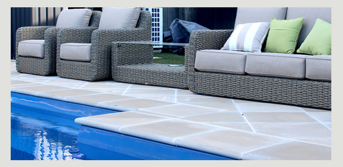
Bullnose pavers are a smooth, rounded edge as an alternative to the standard straight edge. Most commonly used on pool edges and steps.

Yorkstone pavers give a classic English slate look and are often laid in a random pattern. Yorkstone pavers are available in our standard Urban colours and we can also manufacture non-standard and custom colours.